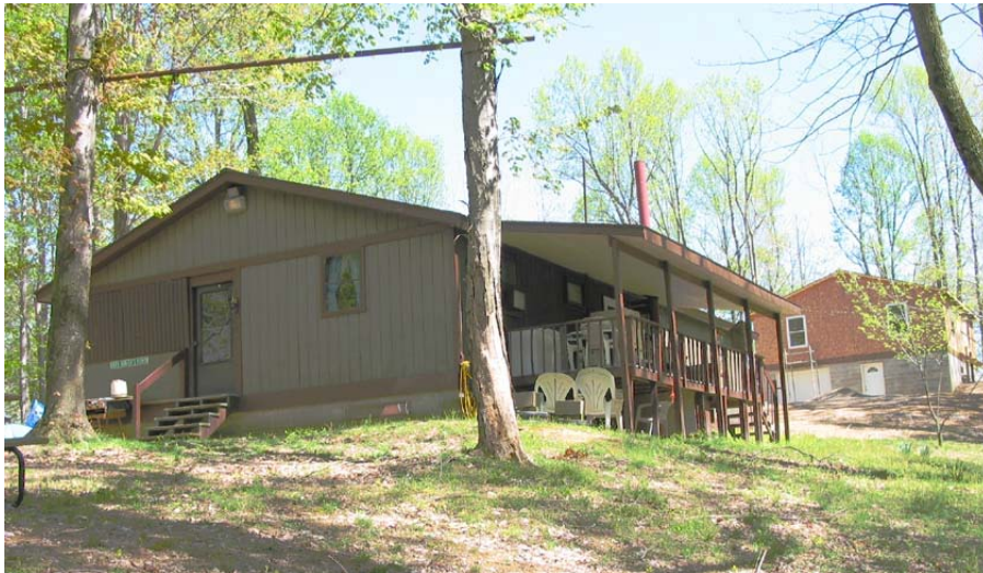
Hunting Camp next to Lemaster's property.