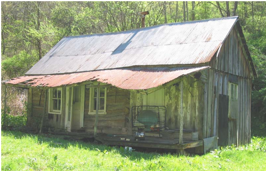
Abandoned camp near Honey Run.